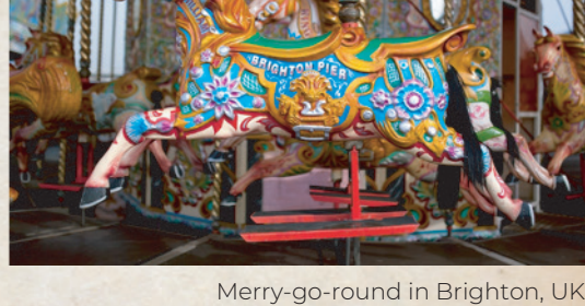
Merry-go-round in Brighton, UK

The carousel industry has become more engaging and sophisticated. This particular attraction of the amusement industry will continue to be present in the world till it exists and will continue to engage kids, teenagers, adults and the entire family as ever before. Irrespective of the latest advancements such as virtual reality, the carousel industry will continue to entertain the audience.