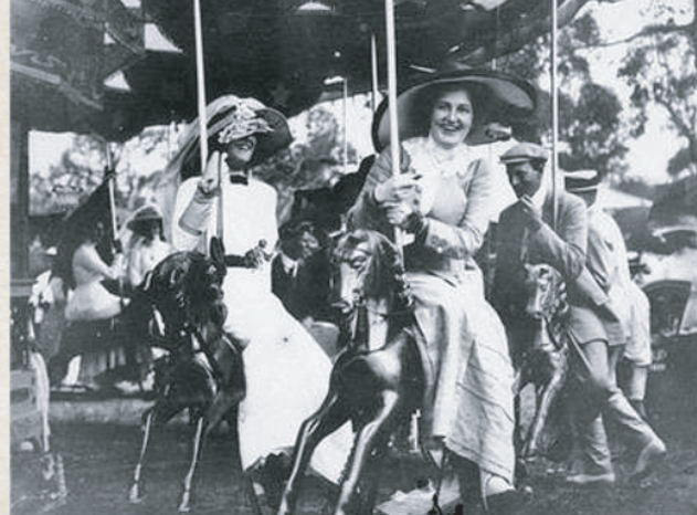
Merry-go-round at Deepwater Races - Deepwater, NSW, c. 1910

Then almost 100 years later, in the 1700s, small versions of the carousel were created for entertainment. Small carousels were set to the music of a live band and powered by men or animals, became popular entertainment at special events of the court.