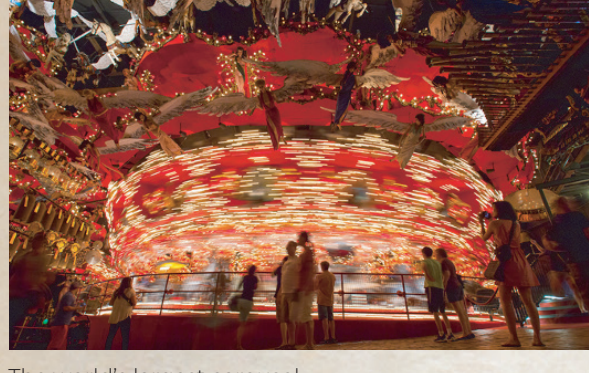
The world's largest carousel

The world's largest indoor carousel is located inside the legendary 'House on the Rock' buildings along Highway 23 south of Spring Green, Wisconsin.