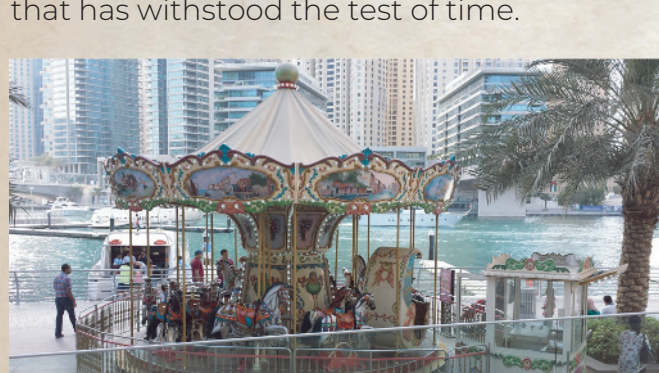
Merry-go-round in Dubai Marina

At the DEAL show we have witnessed the transformation of these merry-go-rounds over the last 26 years. Today, this concept is omnipresent in malls, communities across the GCC, greater Middle East and also the African region. Moreover, this has proven to be a great revenue spinner for the operators over the years and will continue to be a regular source of income. Carousel concepts will still be an integral part of the whole entertainment fabric due to the expansion of the retail sector that includes large malls, in addition to the creation of new communities and theme parks. We will continue to see creativity infused into merry-go-rounds along with other entertainment concepts that has withstood the test of time.