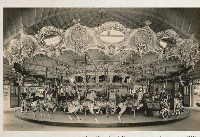
The Dentzel Carousel as it was in 1921

At the tail end of the 19th century, carousels were converted to electric power. It was at this time that the fair organ was moved set beside it. Carousels largely fell out of popularity during WWII, when both supplies and labor were devoted to the war effort, rather than entertainment. During this time much of the craftsmanship was lost. But at the dawn of the twentieth century, there were many companies in the business of supplying merry-go-rounds to amusement parks: the famous workshops of Dentzel, Loeff, Illions, Mangels, Herschell and Parker were a few.