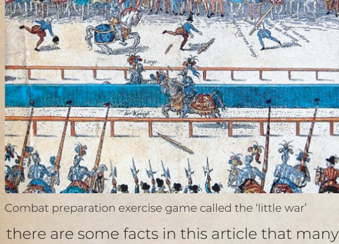
Combat preparation exercise game called the 'little war'

there are some facts in this article that many of us might not be even aware of.